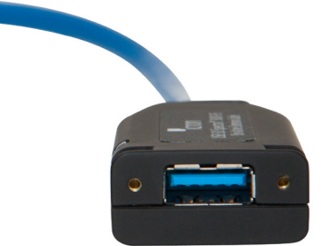
Locking USB Receptacle