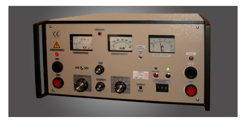
VR6-MU power supply for operating QS1 BWO's

Use of the QS1 system is greatly enhanced through the use of Microtech's DAU control device. This data acquisition unit controls the power supply voltage, allowing the user to control the frequency output of the system. It also includes an interface for THz detectors, a large aperture chopper, and software which can be used to analyze frequency spectra to calculate dielectric constants of a material.