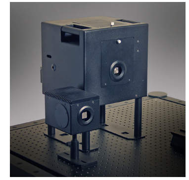
Various magnet housings for QS1-260