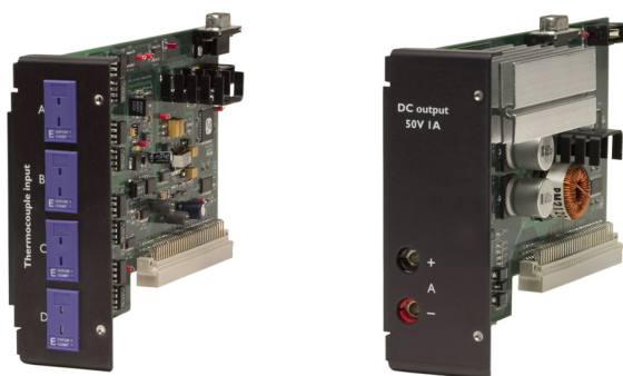
PTC330 Thermocouple Card PTC430 DC Output Card

isothermal block, with its own RTD temperature sensor, provides highly accurate cold junction measurements.