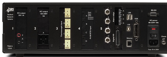
PTC10 rear panel

Macros are a powerful tool that can be used to tailor the behavior of the PTC10 for your experiment. For example, infinite-loop macros running as background tasks can take steps to address alarm conditions, automatically switch between sensor inputs (or heater outputs) depending on the current temperature or other factors, or implement cascade feedback schemes.