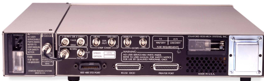
SR625 rear panel

SR625 Frequency counter (w/ Rb timebase and rack mount kit)