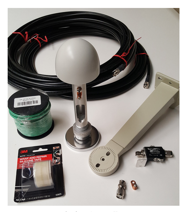
Outdoor Antenna Kit