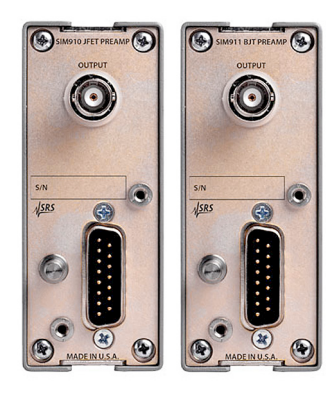
SIM910 & SIM911 rear panels