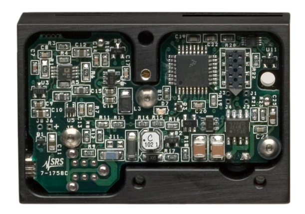
SR475 Shutter Head with cover removed, revealing control system electronics

The 3 mm clear aperture is designed for easy alignment and is large enough to be used with common light sources. Typical rise and fall times are under 500 \ \mu s, and repetition rates from DC to 100 Hz can be used. Unlike other shutters, the SRS shutter is not duty cycle limited — you can run any duty cycle you choose.