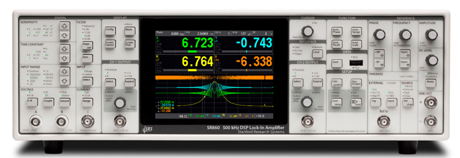
SR860 front panel