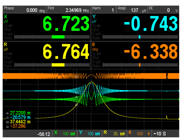
Large numeric readout with strip chart recording

The SR860's effective dynamic reserve is simply the ratio of these two settings. For instance with a 10\,\text{nV} sensitivity setting and a 300\,\text{mV} input range the effective dynamic reserve of the SR860 is 3\times10^7 , or nearly 150\,\text{dB} .