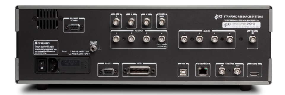
SR860 rear panel