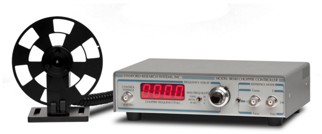
SR540 Optical Chopper

Synchronous filtering may also be selected at reference frequencies below 4 kHz. The synchronous filter notches out multiples of the reference frequency and is extremely useful in making low frequency measurement where multiples of the reference frequency would otherwise show up in the lock-in output. Unlike previous designs the synchronous filter in the SR860 can be selected with no loss of output resolution.